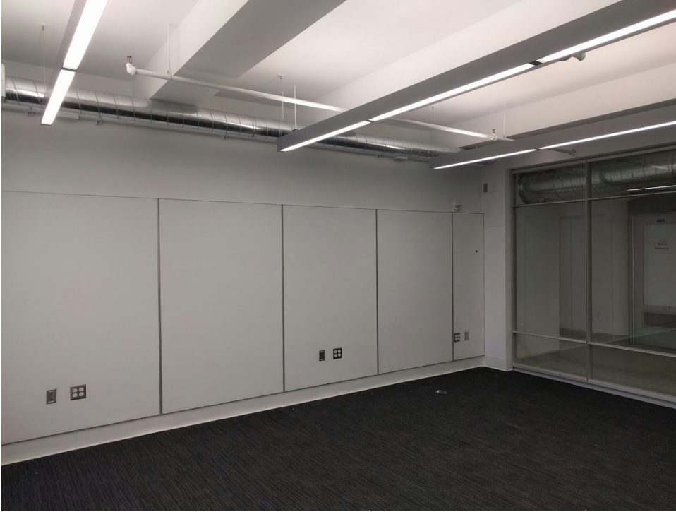
4. Photo from corridor